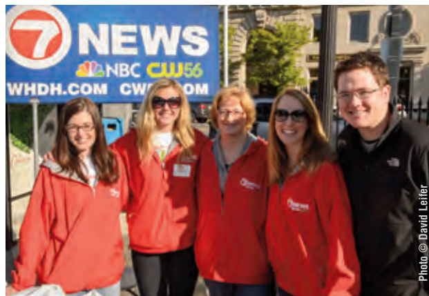
7NEWS team at the 2012 Walk for Hunger

W e gratefully acknowledge the following organizations and individuals for making generous in-kind contributions between June 1, 2011, and May 31, 2012.