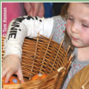
Community Supported Agriculture (CSA) Programs