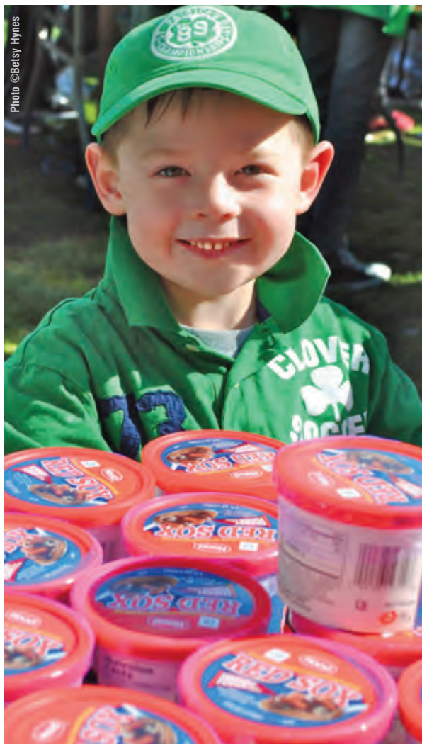
A young boy enjoys the delicious ice cream at the 2012 Walk for Hunger, provided by HP Hood LLC.

We gratefully acknowledge the following organizations and individuals for making generous in-kind contributions between June 1, 2011, and May 31, 2012.