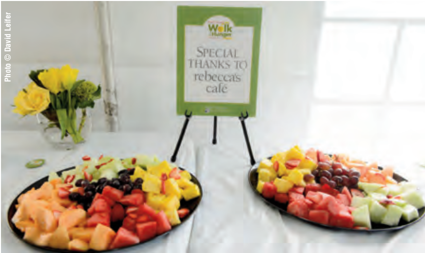
Refreshments provided by rebecca's café at the 2012 Walk for Hunger

We gratefully acknowledge the following organizations and individuals for making generous in-kind contributions between June 1, 2011, and May 31, 2012.