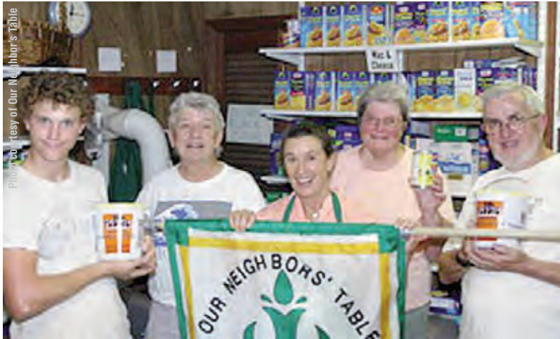
The staff and volunteers at Our Neighbor's Table

The following organizations received grants from Project Bread through its Walk for Hunger and through foundation and corporate support during the 2011 – 2012 funding period. They include emergency food programs, schools, summer food programs, non-profit farms, subsidized Community Supported Agriculture (CSA) programs, Chefs in Schools, food banks, food rescue programs, community gardens, and farmers' markets.