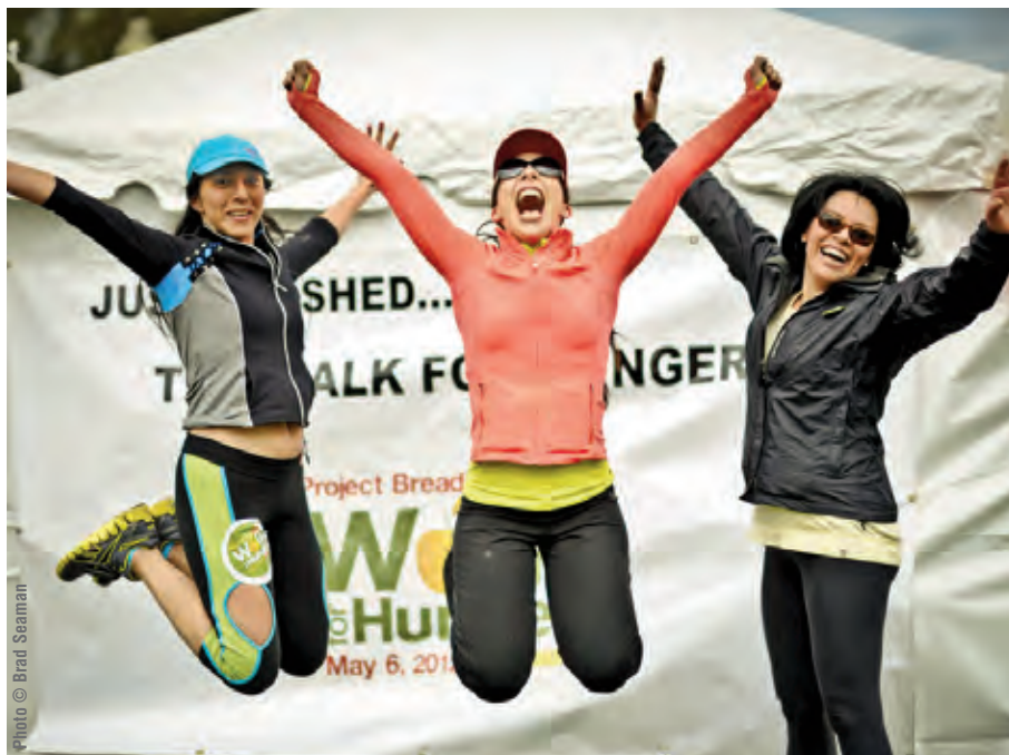
Project Bread – The Walk for Hunger is a private, nonprofit agency.

For the year ending September 30, 2011 and 2010