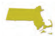
Project Bread – The Walk for Hunger is a private, nonprofit agency.

This is a summary of the financial statements for Project Bread – The Walk for Hunger, Inc. The complete set of financial statements, audited by independent certified public accountants Alexander, Aronson, Finning & Co., P.C. is available upon request.