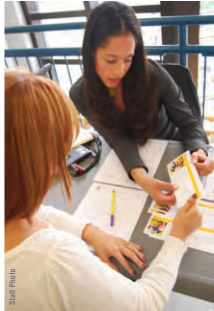
A SNAP worker with a client at East Boston Neighborhood Health Center