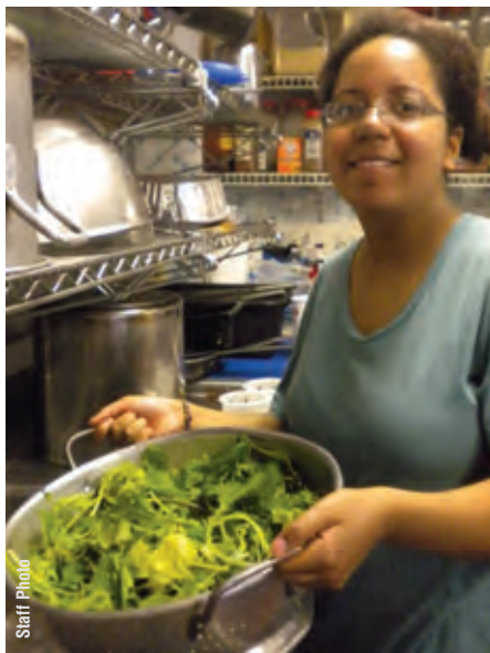
A volunteer helps to prepare a healthy meal at Haley House.

The Salvation Army – Chelsea/East Boston Food Pantry