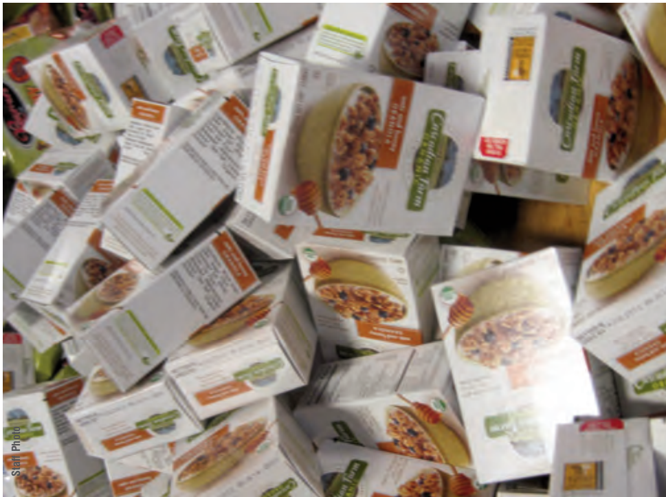
Cascadian Farms supplied snacks for the 2012 Walk for Hunger snack bags.