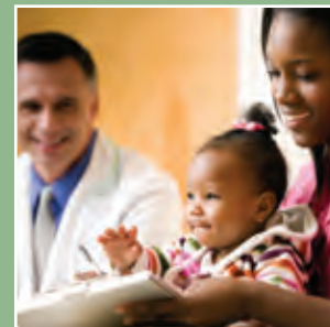
Community Health Centers