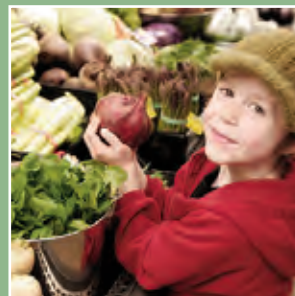
Home Care Organizations