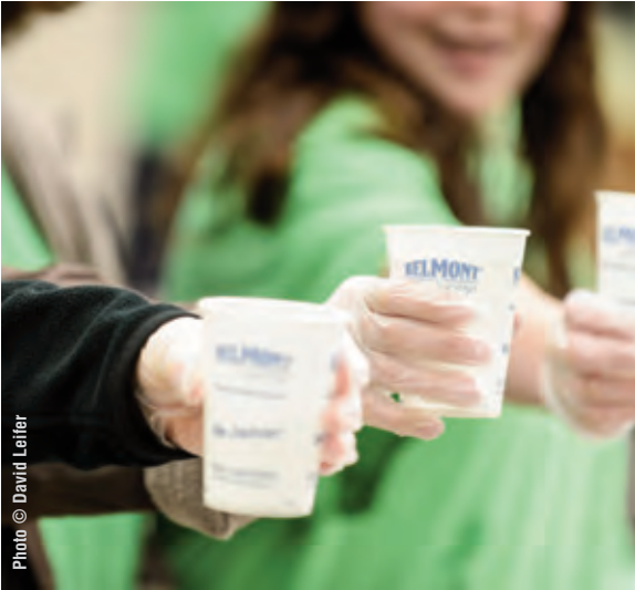
Volunteers at the 2012 Walk for Hunger hand out Belmont Springs water to Walkers

We gratefully acknowledge the following organizations and individuals for making generous in-kind contributions between June 1, 2011, and May 31, 2012.