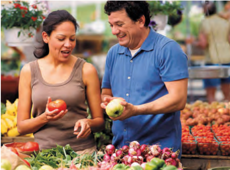
SNAP enables people to buy food in their community.

In partnership with the Department of Transitional Services, Project Bread helps Latino, elderly, and other low-income groups enroll in SNAP/food stamps. The FoodSource Hotline screened over 5,000 households for SNAP/food stamp eligibility and assisted 563 callers complete the application over the phone. Through its work with Health Centers, Project Bread outreach workers assisted 878 low-income households access this vital federal nutrition program that helps families put food on the table.