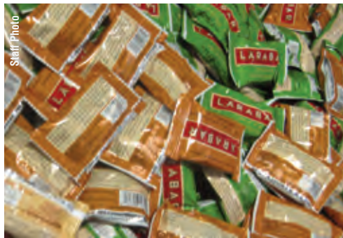
LARABAR also supplied snacks for the 2012 Walk for Hunger snack bags.